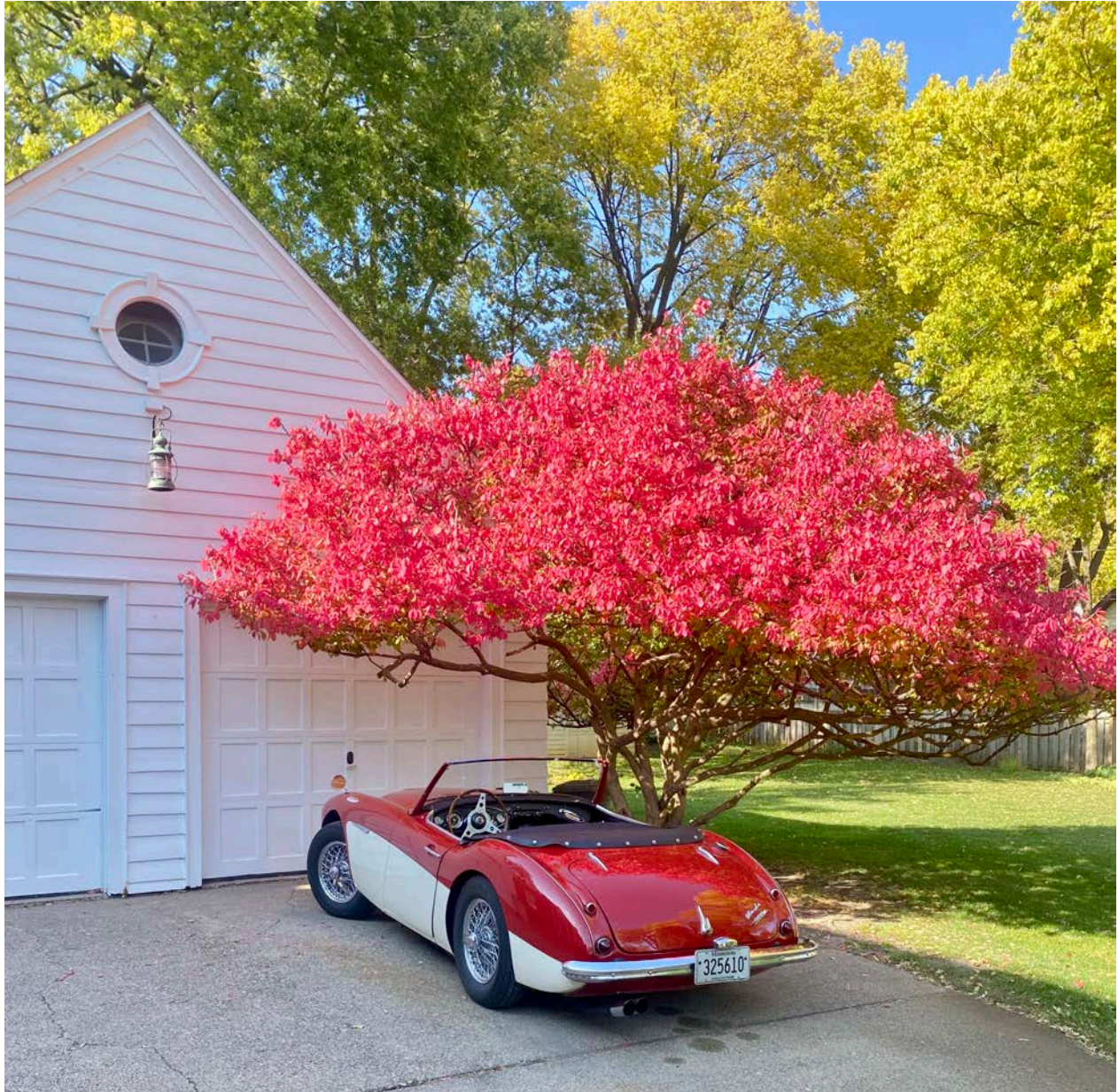
Cliff Black's 1962 BT-7 Tri-Carb after a wonderful drive around Winona, MN, on a gorgeous October day.